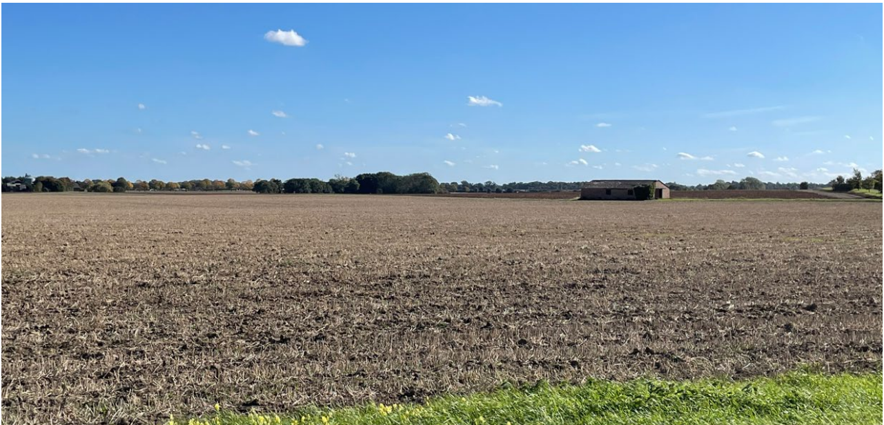
Figure 2. View of Plane Crash Site from Sheldrick's Road/Beck Road. There is an open visual connection to the crash site from the village, with views over to Lakenheath. This would be lost

What is abundantly clear is that if the excluded area proposed of 50 sq metres is accepted, it would be completely surrounded by the development of solar panels and the proposed hedging and wood to screen the development. That visual link from our village to the site will be lost and with it a part of our history, to be replaced by an interpretation board. The interpretation board will point readers to an area which cannot be seen as it would be surrounded by solar panels hedges and a wood. That essential link we have, from the village, Sheldricks Road and Beck Road will be lost and that natural connection with our history will be gone. Hardly a fitting commemoration.